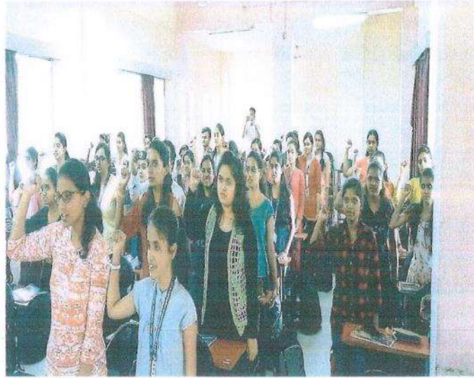
Students are taking pledge for no tobacco