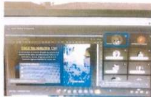
Session by the Resource person