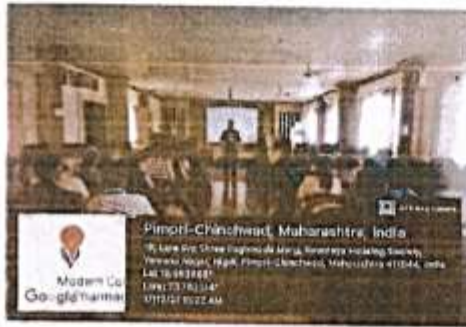
Interaction with Participants