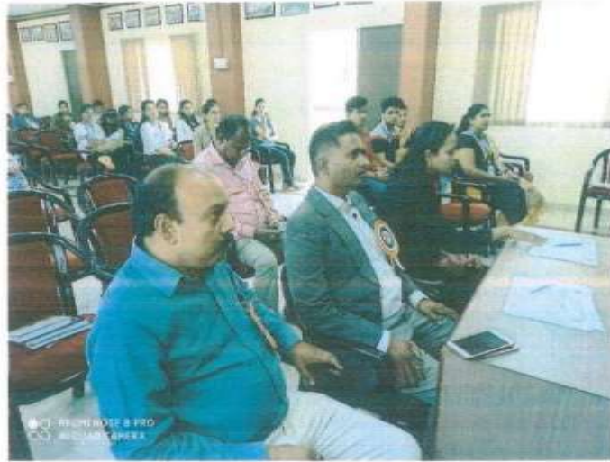
Evaluation of Elocution Competition