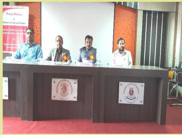
Inauguration of the Seminar